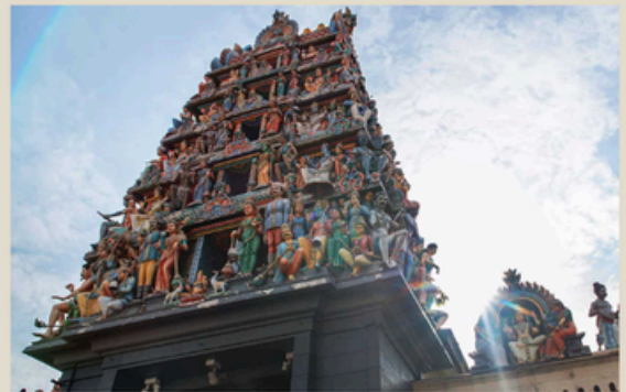
Featured locations: Buddha Tooth Relic Temple Sri Mariamman Temple Chinatown Complex and more!

The walking tour will feature historical and cultural sites in Singapore.