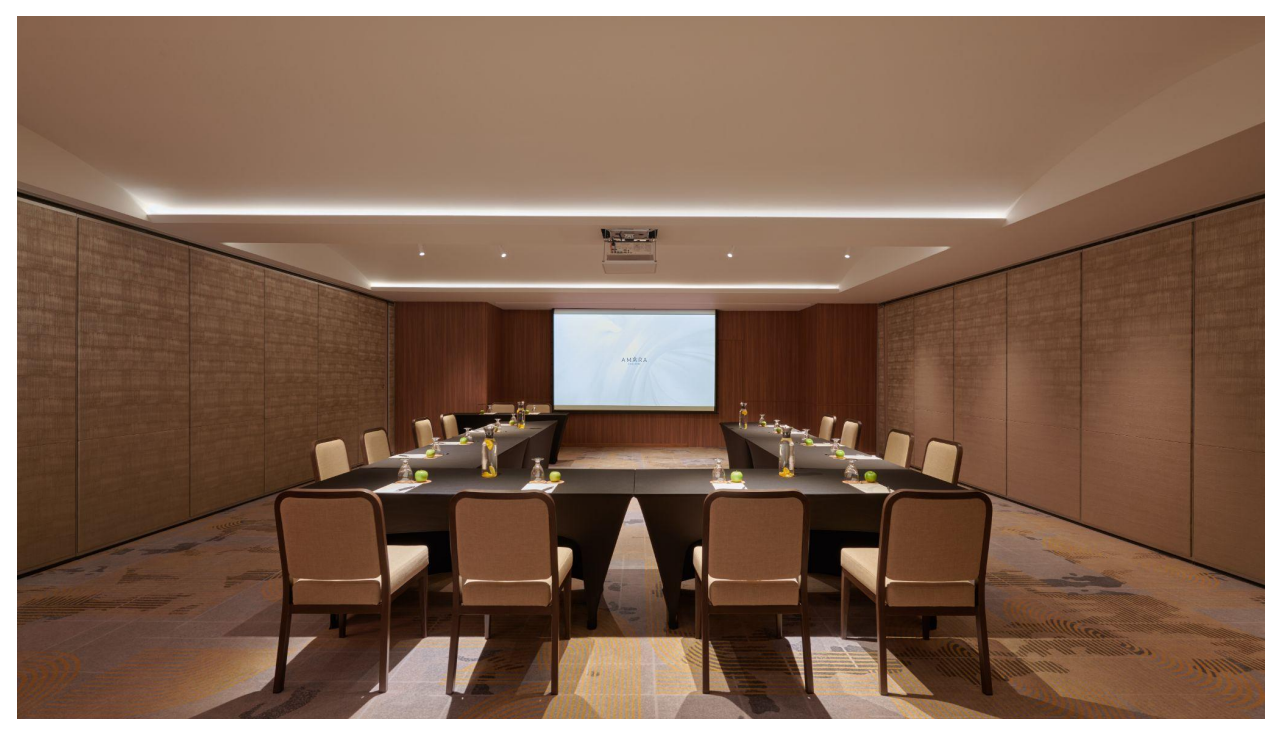
Event and convention room: Connection

Adjacent to the Grand Ballroom, are four Breakout rooms aptly named Connection , ranging from 74 sqm to 108 sqm. Each room has been meticulously designed to cater to diverse corporate requirements, equipped with state-of-the-art audiovisual amenities, flexible seating arrangements and customisable layouts, ensuring a tailored experience for every event.