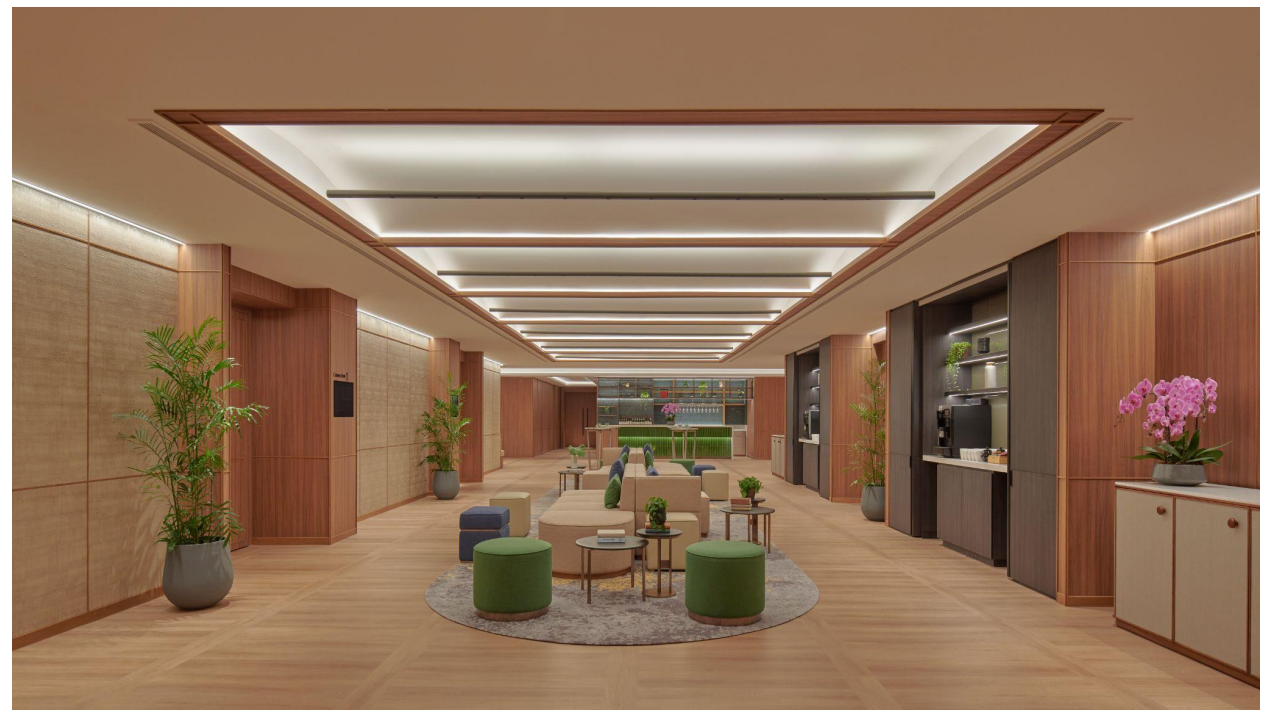
Amara Singapore Foyer

As part of its major transformation, the legacy hotel's revitalised meeting spaces pair state-of-the-art MICE facilities with sophisticated design.