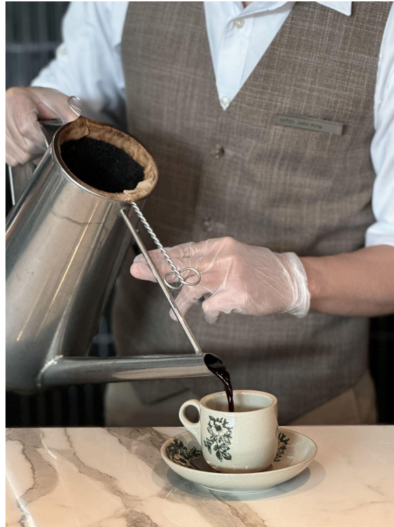
Nanyang Coffee and Popiah Making masterclass at Cafe Oriental