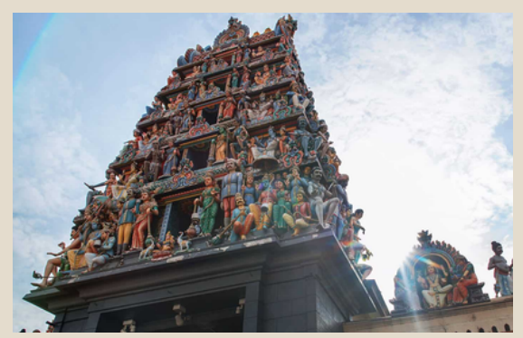
Featured locations: Buddha Tooth Relic Temple Sri Mariamman Temple Chinatown Complex and more!