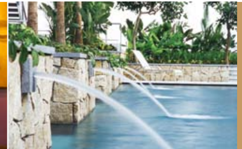
Balinese Style Swimming Pool