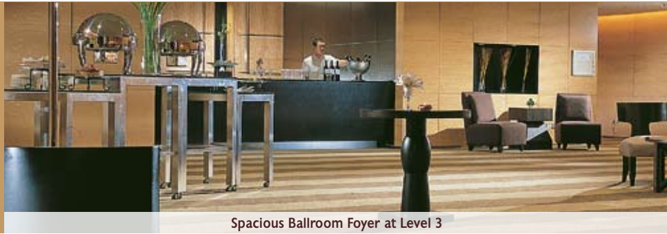
Spacious Ballroom Foyer at Level 3